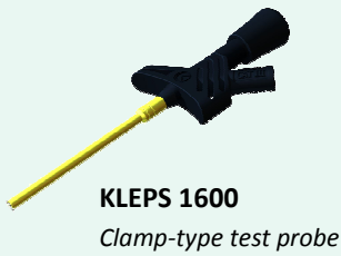
KLEPS 1600 Clamp-type test probe