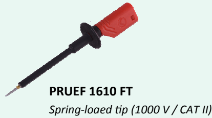
PRUEF 1610 FT Spring-loaded tip (1000 V / CAT II)