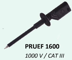
PRUEF 1600 1000 V / CAT III