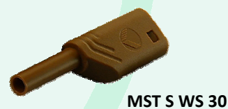
MST S WS 30