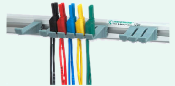
PMS 2 S LMLH 10 test leads with holder