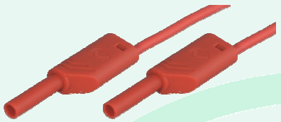
MVL S WS (standard length: 25, 50, 100, 200 cm)